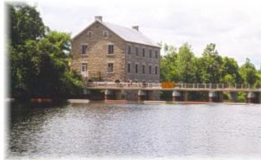
Watson's Mill, on the Rideau Waterway's 'Long Reach'.

Our focus is the 'Long Reach' of the web browser, and the ability of web applications to reduce commuting and pollution, while enhancing both business efficiency and quality of life.