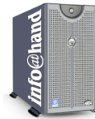
Info At Hand Information Appliance

As organizations increasingly leverage the Internet to deliver key services online, the need for a robust network architecture and infrastructure security becomes para-